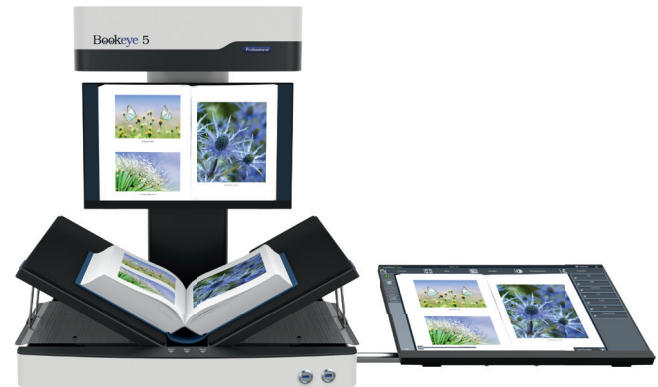
Bookeye® 5 V2