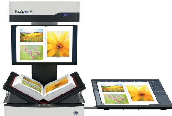
Bookeye® 5 V3

Laser-assisted book fold correction effectively reduces annoying shadows and distortions in the middle of a scanned image of a book when operators are scanning thick bound documents, resulting in a perfectly flat scanned image.