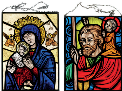
Stained glass church windows scanned on a WideTEK 36ART with backlight option

By installing the optional WideTEK® 36ART backlight module, users can scan with or without backlight, depending on the source material requirements, by simply switching the light on or off.